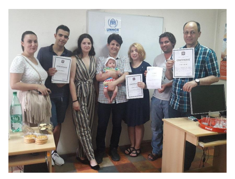
Asylum-seekers and refugees celebrating the completion of their Serbian language course, ©UNHCR, July 2019