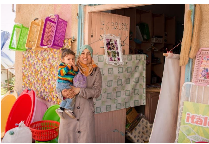
Syrian refugee set up her own business in Nabeul thanks to livelihood programme carried out with UNHCR partner ADRA in 2018