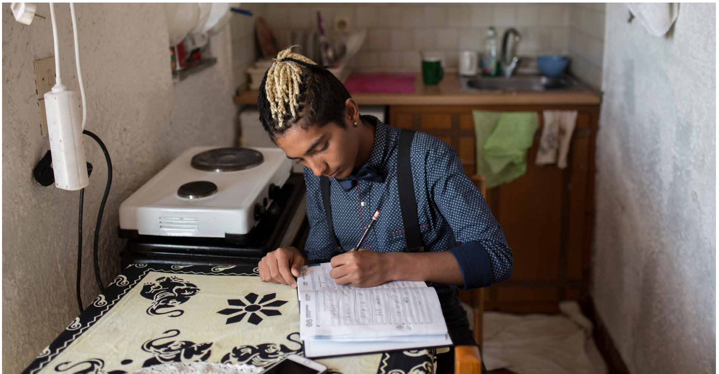
An asylum seeker from Iraq, studies in his apartment provided by UNHCR, on the Greek island of Kos. He came to Kos with his mother, from Baghdad via Turkey. He says: "It changes everything to go to public school".