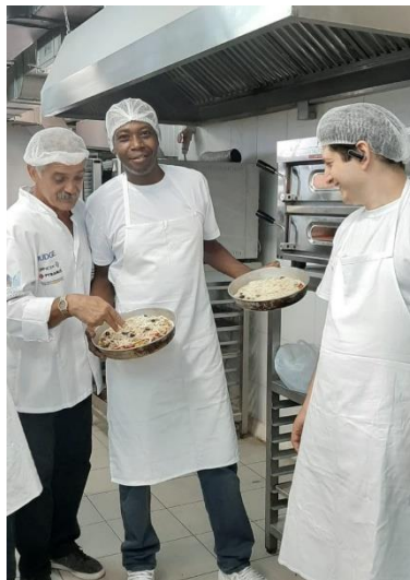
Ten refugee trainees completed a GIZ course for pizza chefs to be employed by Pizza Laganica, supported by the USA, 20 September 2019