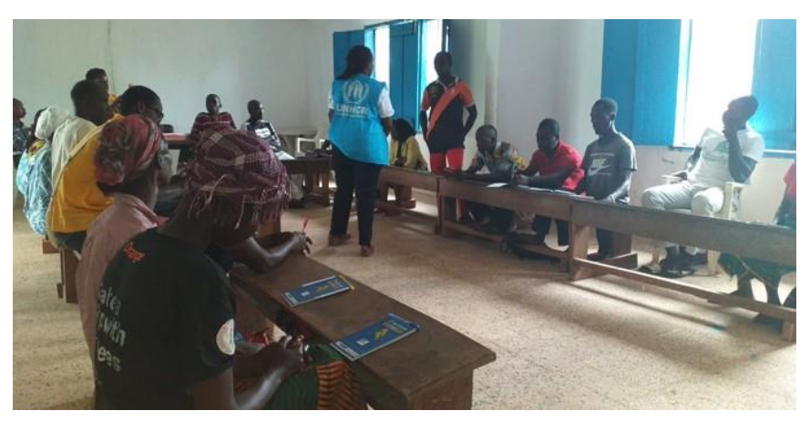
Participants of the Small Business Management Training (SMBT) in PTP Settlement (Grand Gedeh County).

In addition, UNHCR's operational partner CARITAS has begun livelihoods activities in PTP Settlement, including the selection of 150 female-headed households to start an 18-month livelihoods programme. Livelihoods activities currently ongoing in the settlement include agriculture and the running of fish ponds, poultry and piggeries