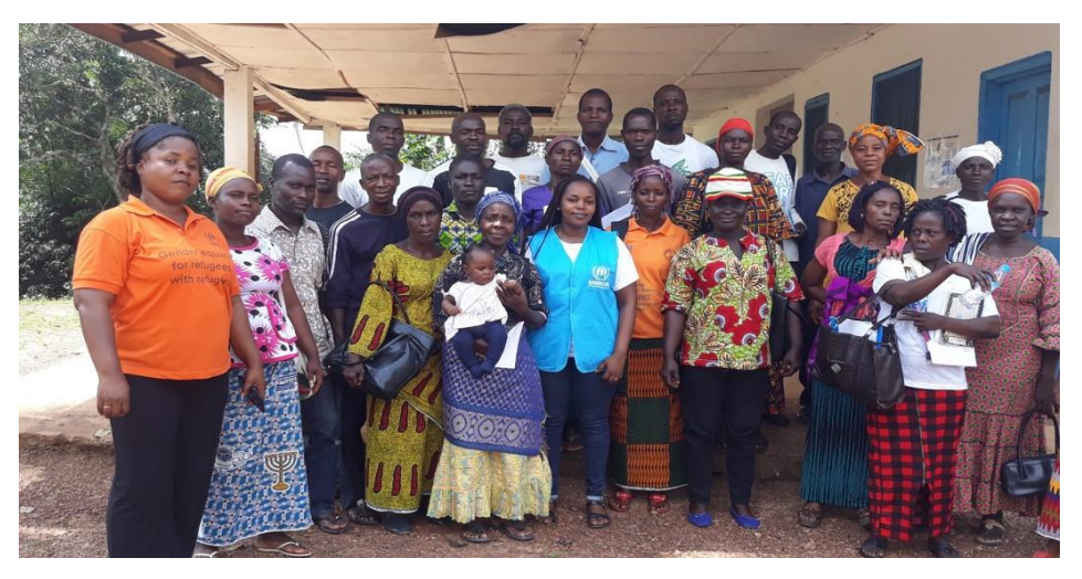
Participants of the Small Business Management Training (SMBT) in PTP Settlement (Grand Gedeh County). Photo: UNHCR/J. Suah/September 2019.