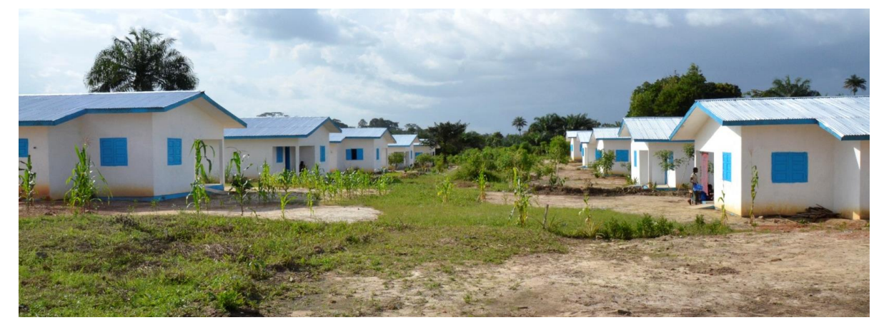
Some of the 13 durable shelter housing units handed over on 11 September 2019 in Bahn Settlement (Nimba County).