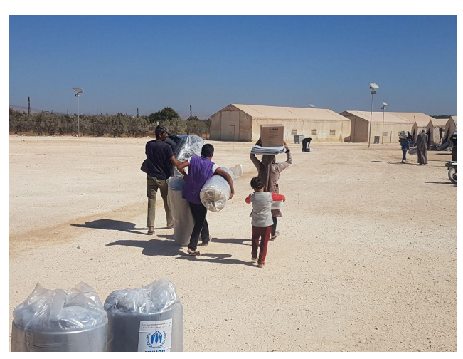
Distributions of emergency NFI kits in Jebel Saman, Aleppo and Maaret Tamsrin, Idleb

Moreover, UNHCR's protection partners conducted awareness raising and psychosocial support sessions, identified cases and referred them to basic services in Idleb and Aleppo Governorates; such community-based protection interventions reached 9,555 people . In addition, 7,092 displaced and vulnerable people received protection services such as awareness raising on civil status documentation and housing, land and properties, legal counselling and assistance, case management and referrals. As a part of the emergency response, sessions on integrated protection awareness, protection risk awareness, information and psychosocial first aid are conducted by UNHCR's partners and people are referred to the needed internal and external services. Those interventions reached 1,020 newly displaced people from northern Hama and southern Idleb.