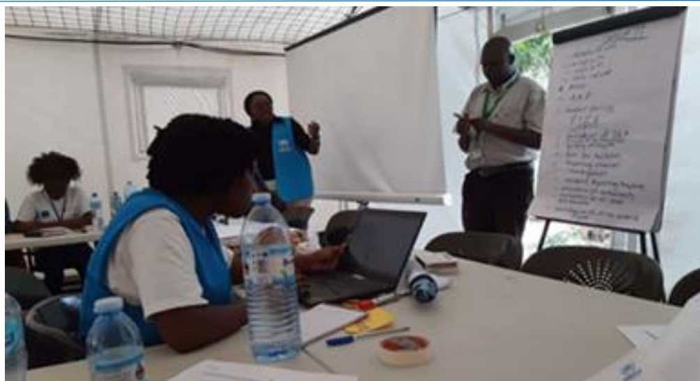
Training on PSEA for Sexual Exploitation and Abuse (SEA) focal persons in Imvepi and Lobule settlements