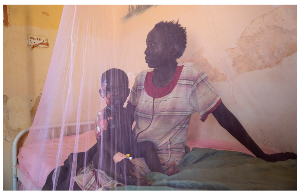
A refugee mother and child in Bunj Referral Hospital, which UNHCR supports, in 2019.

9,516 children participated in recreational activities in child friendly spaces