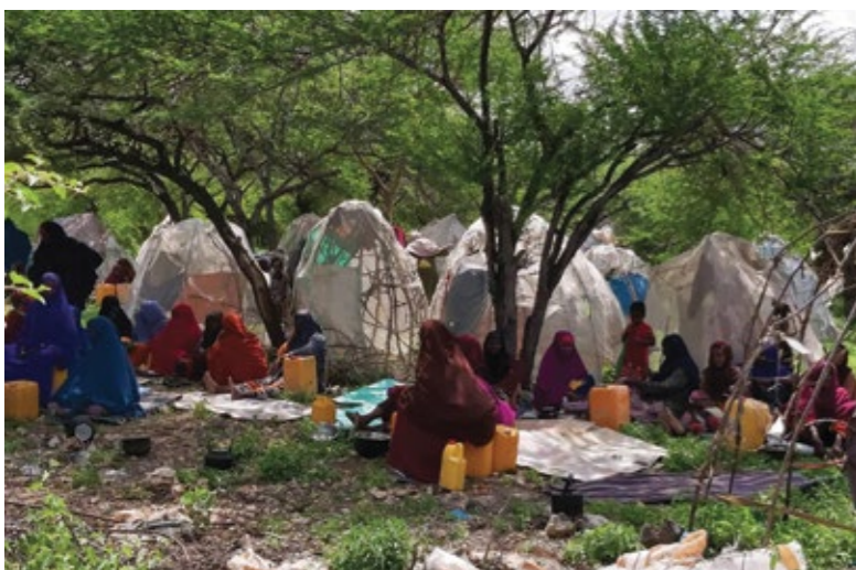
Displaced persons in Berdale, Bay region due to flash flooding. November 2019

CCCM Cluster subnational focal points in Baidoa presented on a panel discussion at the 2nd annual Evidence week, hosted by Regional Durable Solutions Secretariat (ReDSS). The CCCM cluster focal point presented on area based and settlement planning and the role of CCCM in Baidoa.