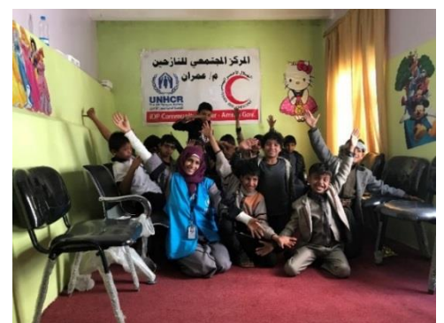
Children participate in a focus group at the UNHCR-supported community centre in Amran Governorate.

UNHCR continues to implement Quick-Impact Projects (QIPs) in Yemen. In Dhamar Governorate, IDPs and host community members jointly decided to use a QIP to improve the road conditions around the UNHCR-supported community centre. The decision-making process is a key part of UNHCR's QIPs which aim to promote social cohesion between IDPs and host communities. The project was designed with the support of local authorities. Across Yemen, UNHCR supports eight community centres, which provide psychosocial support and legal counselling, and serve as a venue for focus group discussions and other forms of communications with communities.