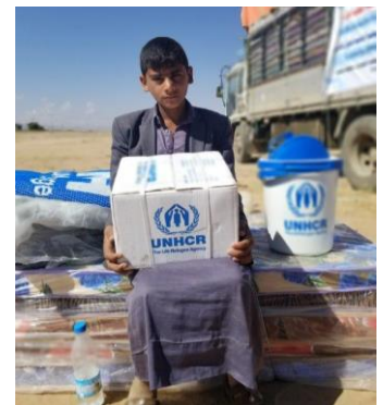
An IDP in Sa'ada Governorate in receipt of core relief items including boxed cooking utensils, bedding and tarpaulin.

UNHCR-supported health centres have provided 107,000 health consultations so far this year. Health care remains a critical need throughout the country with only 45 per cent of health facilities currently functioning. In the context of the cholera outbreak, and of HIV/AIDS and other public health risks, health workers supported by UNHCR have shared essential health and hygiene information with 160,000 refugees/asylum-seekers and 41,000 host community members.