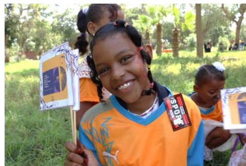
UNHCR and Intersos launched the "16 Days of Activism Against Gender-Based Violence campaign" with a round table and recreational activities for children in Aden.

UNHCR provided a one-off cash assistance to 3,324 refugee families living in Aden and Mukalla city, whose livelihoods were impacted since hostilities broke out in early August in the south. Families with valid ID cards received some USD 220 each to cover their most essential needs.