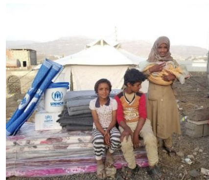
Displaced children by their tent in the southern Ibb governorate, having received UNHCR assistance.

UNHCR continues to deliver lifesaving emergency assistance in the southern governorates of Ibb and Taizz where there are several active frontlines. During the reporting period, 140 IDP families in these two governorates received CRIs and 32 IDP families received family tents. In the coming week, an additional 430 families are to receive CRIs and emergency shelter kits (ESKs) while a CRI replenishment request for 1,500 families has been sent to the country office. A total of 23,335 families have received CRIs and 5,753 families received emergency shelters in Yemen since 2019, with 10 per cent of the total having been distributed in these two governorates. Taizz and Ibb governorates alone are hosting some 14 per cent of the entire IDP and returnee population in Yemen. The highest number of CRIs/ESKs were distributed in Hudaydah governorate (some 5,000), which hosts 10 per cent of the entire IDP and 2 per cent of the returnee populations.