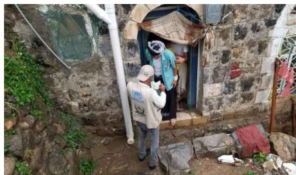
UNHCR and partners conduct home visit assessment in Hajjah. Partners visit each and every household to verify the living conditions of the beneficiary candidate before selecting those who qualify for cash assistance towards their rental subsidies.

During the reporting period, UNHCR partner Jeel Al-Bena conducted the home assessment and verification (for rental subsidy) of 1,028 old and recently displaced IDP families in Hajjah city. Once assessed as a vulnerable household, they will receive rental assistance in two instalments which provides them with cash for rent for a period of six months. According to the IOM-DTM, a total of 438 families have been displaced to Hajjah city since the beginning of this year.