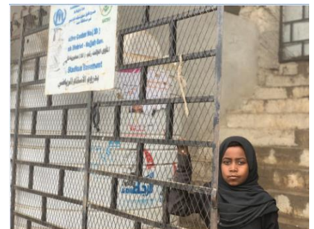
Displaced people from Hajjah and Hudayah governorates live in an IDP site, previously a stadium in Hajjah City.

UNHCR completed the assessment and confirmation of the beneficiaries for cash winter support for 1,086 IDP households in Ash Shamayatayn and Al Ma'aafer districts (Taizz governorate). Beneficiaries include 886 households fleeing violence in Al Hudaydah governorate and 200 from the vulnerable host community. UNHCR SO Aden is providing IDPs in Taizz governorate with winter assistance, after IOM's provision was ended in 2018.