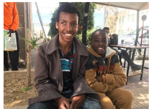
Two Somali teenagers who benefit from support at a physiotherapy centre in Sana'a. UNHCR QIPs have provided equipment to such centres which treat refugees, IDPs and host communities alike.

UNHCR supported the Civil Registration Authority (CRA) offices in Amran, Al Hudaydah, and Hajjah Governorates. Community centres supported by UNHCR and other humanitarian organisations refer IDPs to CRA offices to obtain or update their documentation. The CRA issues IDPs with identity documents that facilitate access to various services including cash assistance. In Amran, UNHCR's QIP worked to improve the electricity supply for the CRA, through installing solar panels. In Al Hudaydah and Hajjah, UNHCR provided equipment and furniture to facilitate service delivery. The head of one CRA office estimated the intervention will halve the time taken for IDPs to receive their documents.