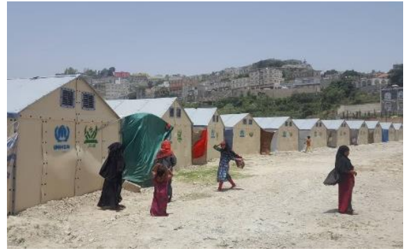
Displaced girls walk around a hosting site in Hajjah. UNHCR and partners have installed 35 RHUs in this area to host displaced families.

With the onset of rising summer temperatures, UNHCR field office Ibb is currently conducting a pilot project to identify the most suitable shelter prototype for the hot, semi-arid local climate of the southern Taizz, Al Dhale'e and Ibb governorates. For example, one option is the Refugee Housing Unit (RHU), designed through a collaboration between UNHCR, the social enterprise Better Shelter and the IKEA Foundation. RHUs offer 17.5m 2 of floor space and can shelter a family of five for up to three years. A total of three RHUs out of the planned 30 have been erected for the returnee families in the western coastal district of Dhubab, Taizz. The internally displaced persons (IDPs) themselves will evaluate the RHUs as well as the other two proposed types of shelter units. The results will then be incorporated into future IDP shelter responses.