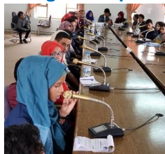
The Yemeni Youth Parliament.

UNHCR has been supporting refugee children's participation in the Yemeni Youth Parliament since 2012. A team of eight refugee and two IDP children from a total 71 members are now participating in the Parliament. In early July, the representatives attended the Parliament's biannual event to convey messages of refugee and IDP rights in Yemen. Throughout the year, the representatives, also hold other activities in their schools, including advocating for the rights of children and with the support of UNHCR, underlining the importance of child protection.