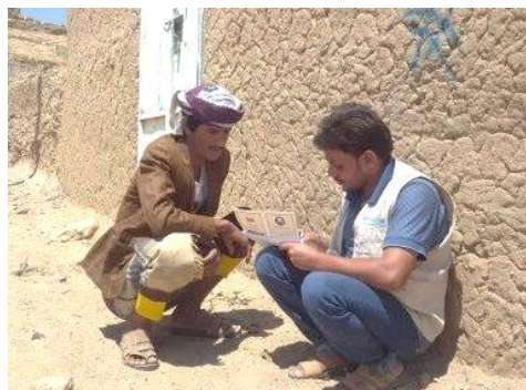
UNHCR partner YDF interviews an IDP during a needs assessment exercise in Sa'ada governorate.

In Aden, UNHCR and partner NMO assisted 56 conflict-affected families (305 individuals, mostly women and children) in Buraiqa district. In Sa'ada, UNHCR and partner YDF reached 500 IDPs families in Ghamr district, with NFI kits. Families received blankets, mattresses, kitchen sets, mosquito nets, water buckets, sleeping mats and solar lamps. Some 800 families were also provided with mosquito nets in Houth district, Amran Governorate.