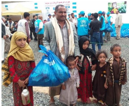
UNHCR started the distribution of clothes for Eid, targeting 450 IDP children and children from vulnerable hosting families.

On 1 August, UNHCR staff distributed Eid clothing and gifts to 450 targeted children in Sa'ada IDP community center, Sa'ada governorate. The recipients were selected from Sa'ada city and Akwan area during previous field assessment visits. An official ceremony was prepared at the IDP community centre attended by the de facto run National Authority for the Management and Coordination of Humanitarian Affairs (NAMCHA), local authority representatives, UNHCR staff, and local media.