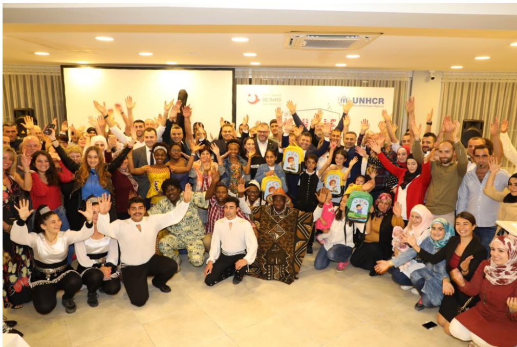
Participants gather for a group photo after the neighbourhood gathering held in Fethiye, Muğla on 18 October, which brought together refugees and the host community to foster a culture of living together.

As of end of October, close to 15,020 submissions for resettlement of refugee cases (64 per cent Syrian and 36 per cent refugees of other nationalities) were made to 18 countries. Over 9,701 refugees departed for resettlement (78.5 per cent of them Syrian).