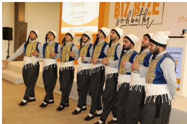
Performance by the Folk Dance Team of Osmaniye Public Education Center during the engaged conversations event in Osmaniye on 23-24 October.

Additionally, two Engaged Conversations were held in Konya and Osmaniye in October. The two events collectively reached around 620 refugees and host community members. They included four focus group discussions with refugees and four with host community members focusing on social cohesion. The engaged conversations were also covered on various government websites and the media. DGMM representatives, including the Head of Harmonization and Communications Department and the Head of the Department of the Protection of Human Trafficking Victims, emphasized the contributions refugees and migrants make in their host countries, stressing that generalizations should be avoided and respect maintained regardless of ethnical, religious and cultural differences.