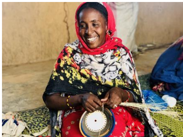
Refugee artisan woman in Goudoubo camp making a lampshade for the UNHCR MADE51 initiative