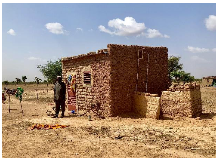
An internally displaced man in Barsalogo is standing in front of the house he built with the help of a cash grant provided by UNHCR.