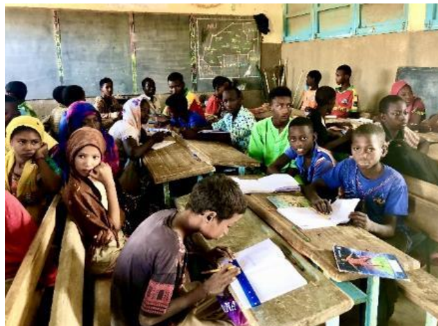
Refugee students in class in the newly constructed secondary school in Goudoubo.