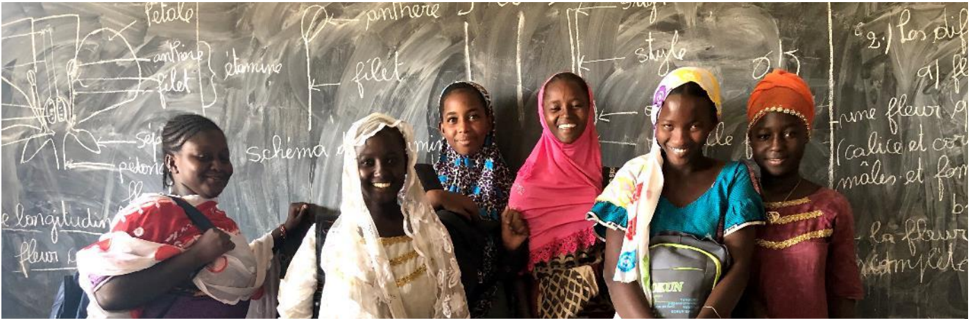
Young refugee girls who are happy to be able to attend the new secondary school in Goudoubo camp in Dori, funded by the European Union Trust Fund