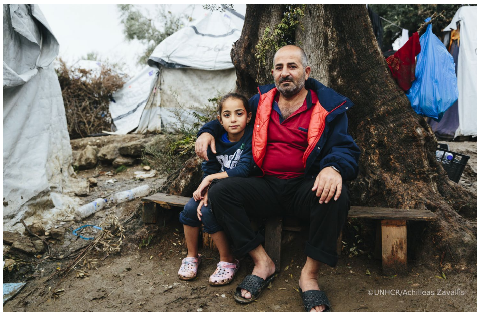
Asylum-seekers at the informal expansion outside Moria reception centre on Lesbos.

4 Field Units in Evros, Ioannina, Leros, Rhodes