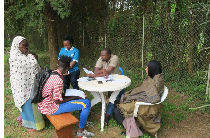
The REC session at Nakivale settlement

The Ugandan Government is responsible for Refugee Status Determination (RSD). UNHCR works with the Refugee Department within the Office of the Prime Minister and other partners to build and enhance the capacity of national RSD procedures.