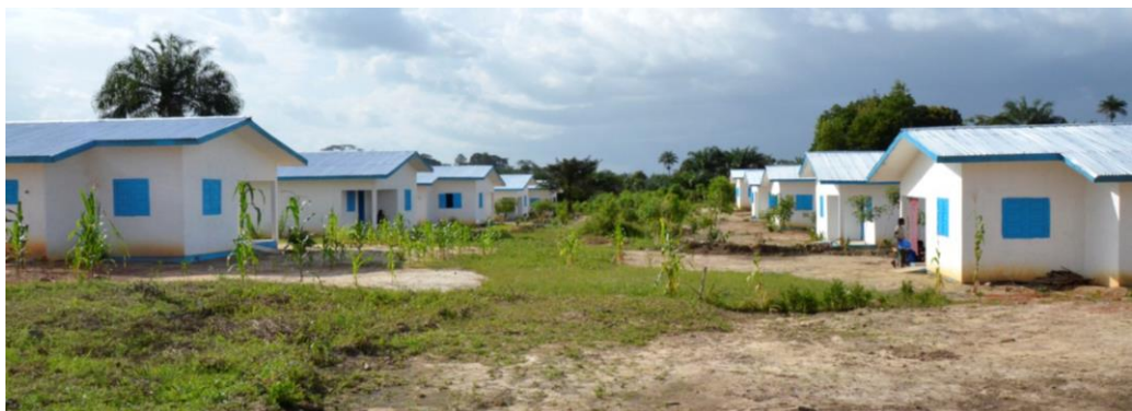
Some of the 13 durable shelter housing units handed over on 11 September 2019 in Bahn Settlement (Nimba County).