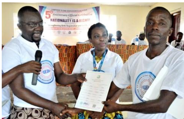
LRRRC Executive Director (L) and UNHCR Senior Durable Solutions Officer (centre) handed over several birth certificates, provided with the direct support of Church Aid.