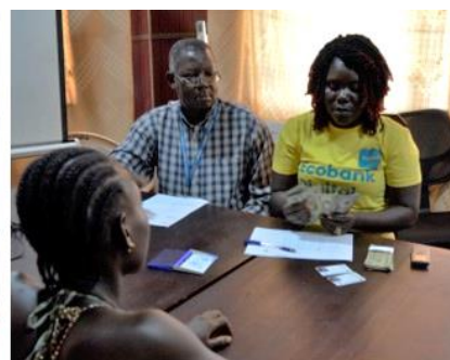
Urban refugees in Monrovia (Montserrado) also received their seed capital aimed to improve their income generating activities (IGAs).