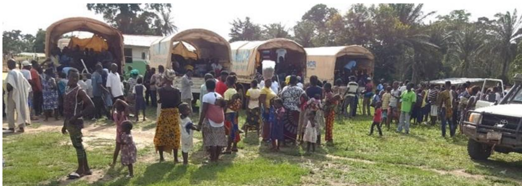
Ivorian refugees in PTP Settlement get on the convoys to return home.