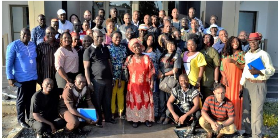
Participants to the stakeholders meeting in November 2019 included LRRRC; AIRD; Ivorian refugees; Liberian host community members from Nimba, Grand Gedeh and Maryland counties; ministries of Internal Affairs, Education, Health, Finance and Development Planning (MFDP), Justice, Liberian Immigration Service; the Resident Coordinator Office and UN Agencies (UNDP, WFP, UNIDO and IOM).