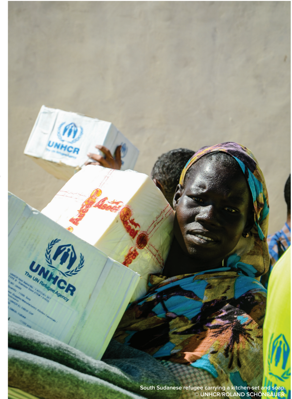
South Sudanese refugee carrying a kitchen-set and soap.

Between 2010 and 2013, UNHCR, the UN Refugee Agency, and the Commissioner for Voluntary Humanitarian Works, in collaboration with IOM, assisted the return of some 75,000 people by road, river, train and air. However, in 2013, as conflict erupted in South Sudan, many South Sudanese people were left stranded and were unable or unwilling to return. As a result, the departure points in Khartoum have gradually evolved into so-called "Open Areas," where South Sudanese people are now living as refugees in poor conditions.