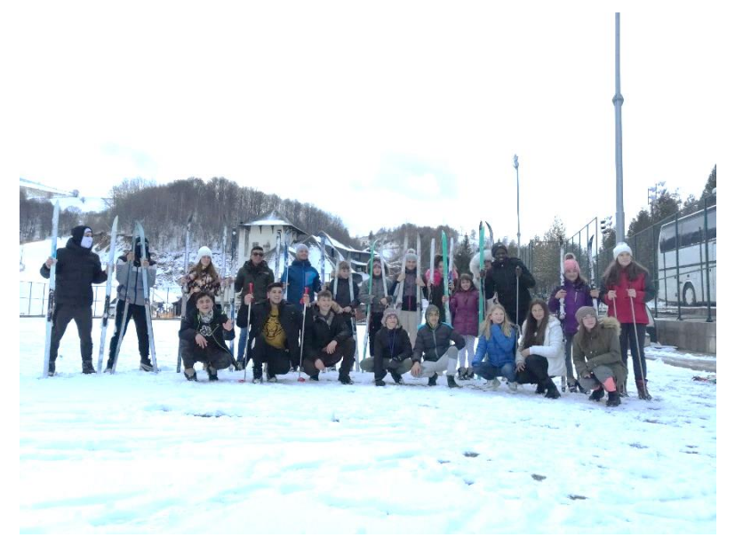
UNHCR suported 9 UASC and 2 guardians to join a youth winter camp in Kopaonik, ©UNHCR, February 2020