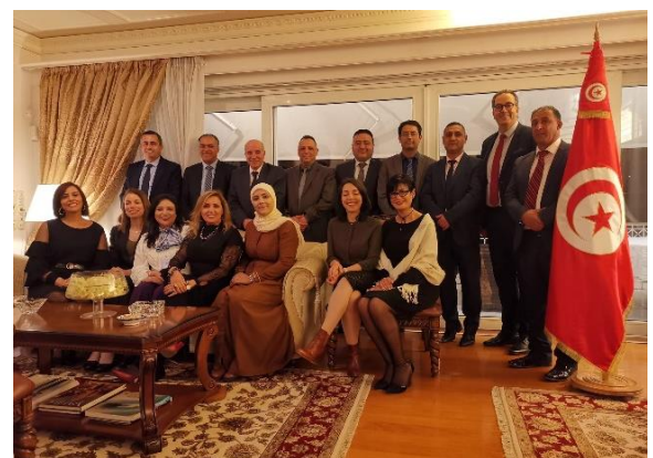
The participants in the study visit to Greece were received by the Tunisian Ambassador to Greece

A study visit was organized to Greece from 12 to 15 February with a group of Government officials from various Ministries (Interior, Defence, Foreign Affairs, Social Affairs), Parliament, and the Presidency. This is the fifth study visit jointly led by UNHCR and its partner the Arab Institute for Human Rights (AIHR) to increase the Government's exposure and knowledge of asylum and refugee issues based on other countries' experience. With support from the European Union-funded Regional Development and Protection Programme, the visit highlighted similar challenges between Greece and Tunisia in the management of mixed population flows, particularly in the identification and referral of persons of concern.