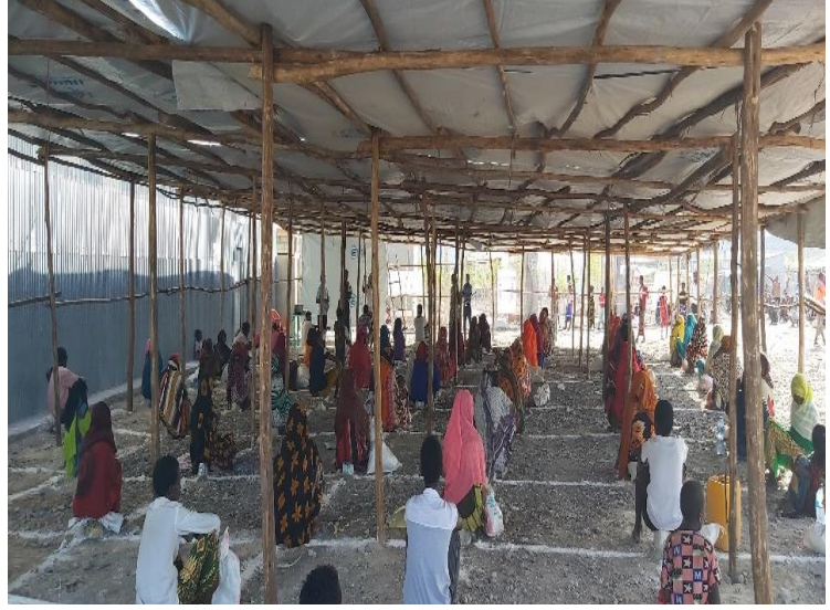
Refugees in Aysaita Refugee Camp practice social distancing while on a queue to collect their regular food rations.

Preparedness and response: Aid workers, medical workers and refugee representatives are on the front lines of this pandemic, providing refugees and host communities with information via announcements posters. hotlines about COVID-19 and how to protect themselves. In parts of Oromia and Benishangul-Gumuz Regions, UNHCR has partnered with a national radio station to disseminate awareness messages Amharic and in Oromiffa languages. Infection