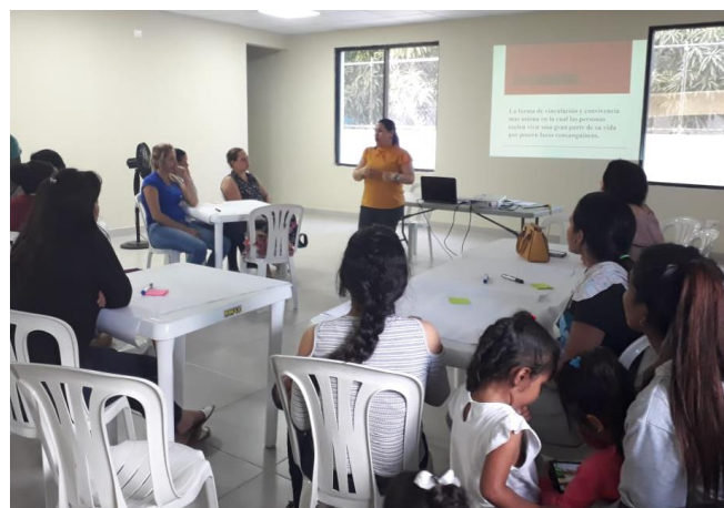
Workshop on parenting skills for Venezuelan mothers in Santo Domingo