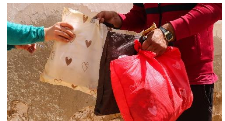
UNHCR partner CTR distributing hygiene kits in southern Tunisia

Starting from 18 April, 1,327 hygiene kits, including gloves and masks, were distributed to refugees and asylum seekers living in shelters and urban areas of Sfax, Medenine, Zarzis, Ben Guerdane, Tataouine. During the distribution, awareness sessions on preventive hygiene measures to adopt were conducted. Psychologist from partner CTR was also present to provide counselling.