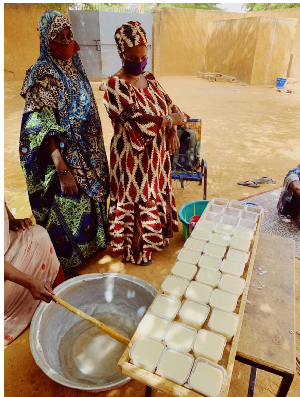
Soap production by refugee in Niger as part of UNHCR's COVID response.