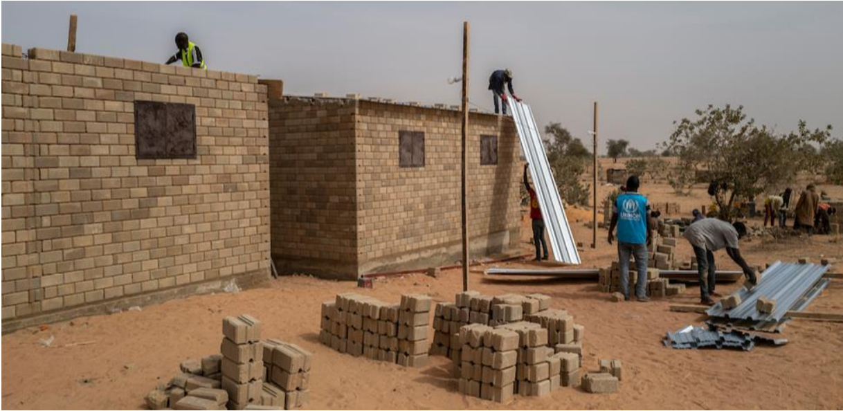
Construction of social housing for the most vulnerable refugee and host community households is ongoing in the Tillabery region. UNHCR has pledged to construct 4000 social houses in Tillabery.