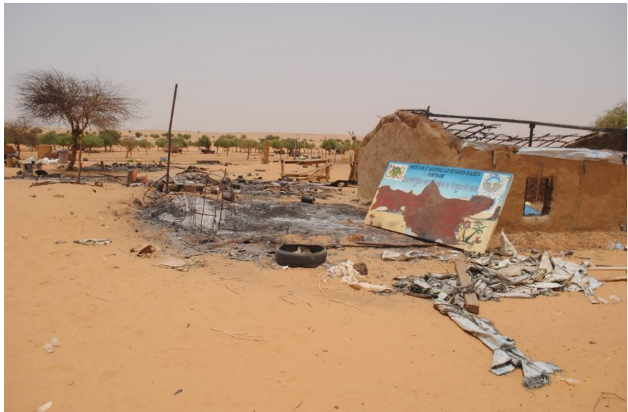
Situated about 70 kilometers from the Malian border, the Intikane site is home to some 20,000 refugees and over 15,000 internally displaced Niger nationals.