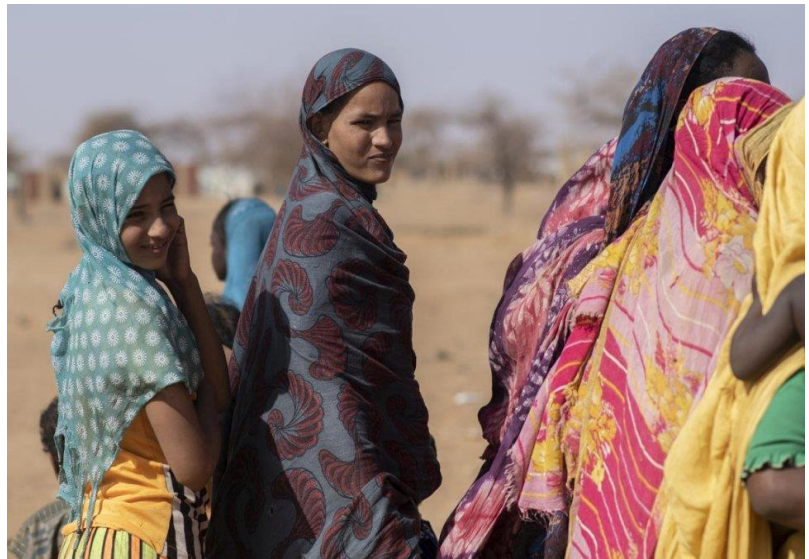
Malian refugee women who lived in Goudoubo camp before they were moved following the increase in attacks and the repeated threats on their community since the beginning of 2020.