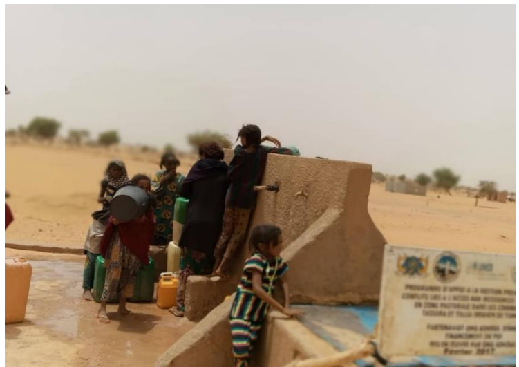
In Temelces, the large influx of refugees and IDPs since the beginning of the year has increased pressure on already limited basic services and natural resources such as water.