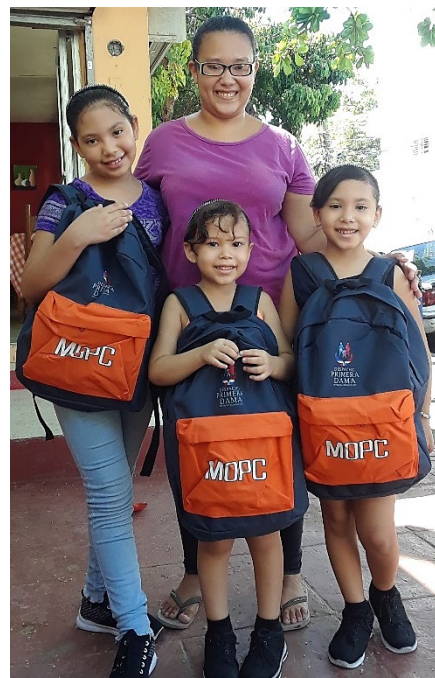
Dominican Republic R4V partners distribute Education kits in 2020

In Guyana , partners developed the capacity of 10 local teachers on English as a Second Language (ESL) and, in 2019, 174 Venezuelan and returning Guyanese children took part in ESL after-school classes. Additionally, 185 out-of-school children participated in a partner's community-based ESL classes as a way of fostering social cohesion and promoting integration of refugee and migrant children into the national education system. Members of the T&T EWG 7 delivered six training sessions to 40 teachers of local schools which are jointly run by the Catholic Education Board of management (CEBM) and the Ministry of Education. Trainings were based on the rights of refugees & asylum seekers, culturally responsive and child friendly teaching, child safeguards, managing the educational environment, the impact of trauma on learning, and supporting the integration of refugee and migrant children into Education Systems. One implementing partner also met with the Minister of Education in August 2020 to discuss the Venezuelan refugee and migrant situation, and on how the authorities and partners could collaborate to increase access to education. The same implementing partner handed over copies of its most recent children's publication, "Un Cuento De Esperanza" to the Ministry of Education in April 2021 and the government indicated authorities are working on a Migrant Education Support Unit to ensure migrant children and their parents get necessary support.