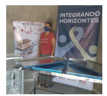
Strengthening of entrepreneurships initiatives in La Guajira.