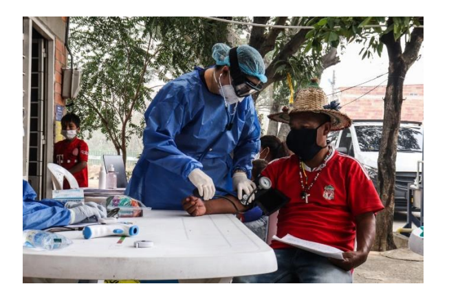
Medical workers implementing medical checks in the Yukpa community in Norte de Santander. / Samaritan's Purse