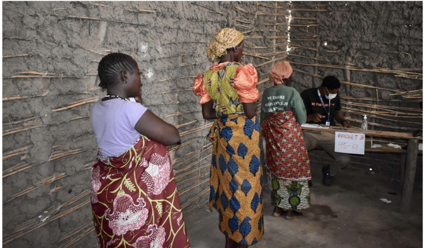
IDPs respecting social distancing while queuing for a multi-purpose cash assistance in Bembei IDP site in North Kivu, DRC.

UNHCR is working with governments, WHO and other UN agencies and NGOs to secure the inclusion of refugees, internally displaced persons (IDPs), stateless people and other marginalized communities in preparedness and response measures.