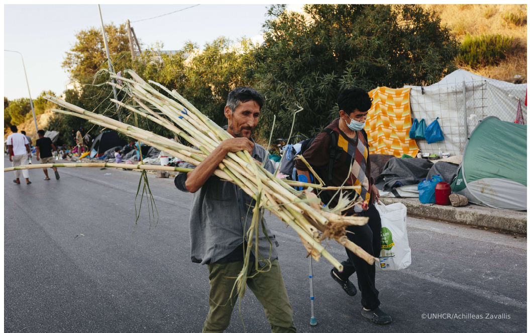
An asylum-seeker carries bamboo to build a makeshift shelter for his family, after the Moria reception and identification centre was destroyed by fires.