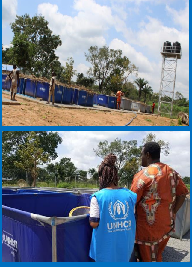
The collapsible fishponds installed in the Agadom settlement to conduct fish farming activities.

To address these negative effects of COVID-19 and to help refugees secure a source of income and food, UNHCR is implementing various agricultural initiative. Among these projects, UNHCR has recently targeted 48 Cameroon refugees in Ogoja with an intensive training fish farming and provided them start-up kits for which include fingerlings and fish feeds to start their own production. The farm village in Adagom settlement includes