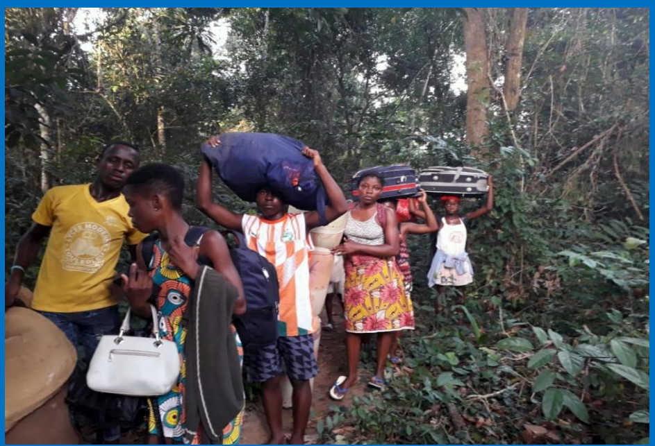
Ivorian refugees continue to arrive in Liberia, Ghana and Togo. Most of them are women and children from Côte d'Ivoire's west and southwest regions.

The vast majority of these new Ivorian refugees have fled to Liberia and over 60 per cent of them are children, some of whom arrived unaccompanied or separated from their parents. Older people and pregnant women have also fled, most carrying just a few belongings and little to no food or money. Most of them have settled among local communities where there are little preventives measures are in place to mitigate the risk of COVID-19 contamination.