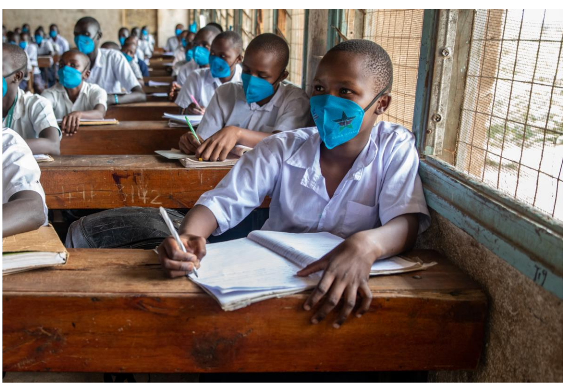
Grade 8 learners at Arid Zone Primary School, Kakuma attend a language lesson while wearing facemasks. UNHCR and partners are implementing COVID-19 protocols to ensure a safe environment for refugee students and teachers and are supporting host-community schools.

In Rwanda , the Ministry of Education announced the national schools reopening calendar for 2020-2021 with a gradual return approach starting with higher grades on 3 November. UNHCR and partners are supporting the public schools where refugee students are integrated to have the COVID-19 prevention requirement in place ready, for instance availing handwashing facilities.