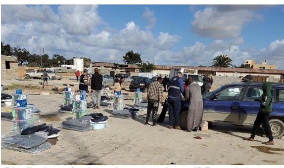
Distribution of winter items at three IDP settlements in Benghazi.

UNHCR continues to support the internally displaced (IDPs) who were forced to flee their homes but remained in the country. On 1 December, UNHCR through its partner, LibAid distributed CRIs to 74 internally displaced Tawerghan families at three locations in Benghazi, as part of a winter distribution campaign. Assistance included solar lamps, blankets, kitchen sets, wet wipes, hygiene