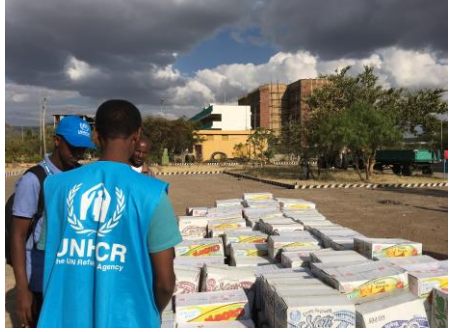
On 26 November, the Ethiopian Red Cross Society with support from UNHCR delivered 600 cartoons of biscuits to the IDPs sheltered in three IDP sites in Shire.