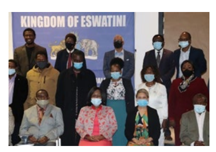
Session with members of the Parliament

On 11-12 November, the Ministry of Home Affairs and UNHCR convened an information session with the two chambers of the Parliament (the Senate and House of Assembly) and the Attorney General. The purpose of the meeting was to raise awareness about the #IBelong campaign and to advocate for the swift implementation of the EXCOM High-Level Segment pledges on gender equality in nationality legislation.