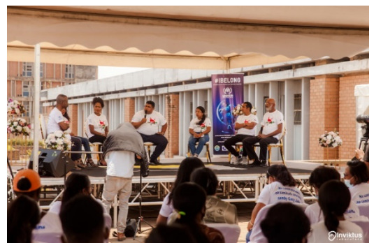
Madagascar debate on the right to nationality, featuring interventions by singer Jiaby Gasy

On 14 November, with the support of UNHCR, Focus Development Association marked the 6<sup>th</sup> anniversary of the #IBelong campaign in Madagascar, through streaming a talk show on Facebook, on the topic of "the right to nationality". The talk show, which featured the famous artist Jiaby Gasy, also a High-Level Supporter of the #Ibelong campaign in Madagascar, was able to reach over 100, 000 Internet users and generate over 10, 000 interactions.