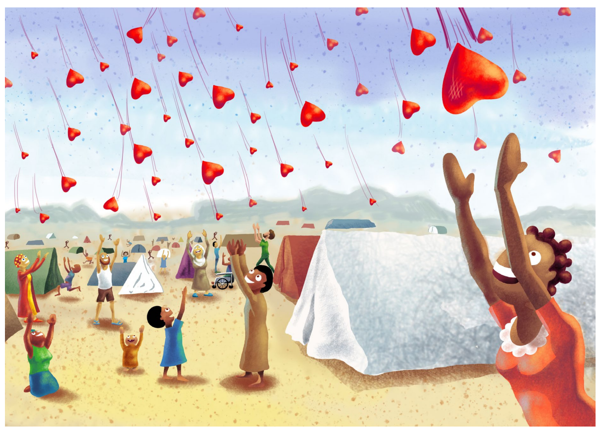
UNHCR 2020 Youth With Refugees Art Contest.

The #IBelong Campaign marked its 6<sup>th</sup> year anniversary in November. On this occasion, several activities took place in the region raising awareness about statelessness, the importance of belonging and the role of the UNHCR, governments and civil society in bringing an end to statelessness in the region