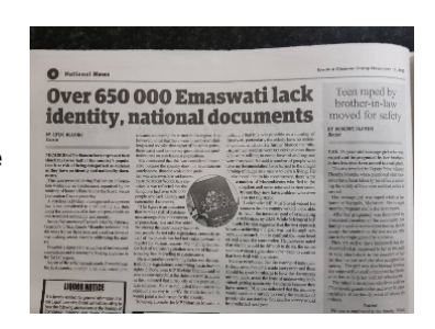
News article on statelessness published in the Swazi Observer

A training workshop took place on 13 November directed to print, radio and TV journalists. The event was of great significance, as it coincided with the celebration of the #IBelong Campaign and the anniversary of the adoption of the Eswatini National Action Plan on the Eradication of Statelessness. The workshop aimed at mustering interest and building capacity of journalists, it resulted in several articles on statelessness in Eswatini being published in local media.