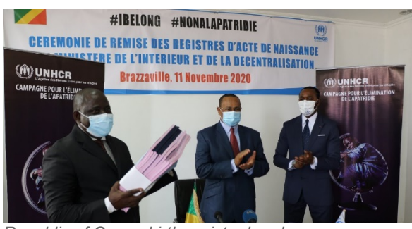
Republic of Congo birth register handover ceremony

On 11 November in Brazzaville, the UNHCR provided support for 2,000 birth certificates registers to the Ministry of Interior and Decentralization. This support follows a request from the Government which intends to issue birth certificates to people without, identified during the civil status census conducted in 2018. These birth records will be delivered to the 172 civil registration centres.