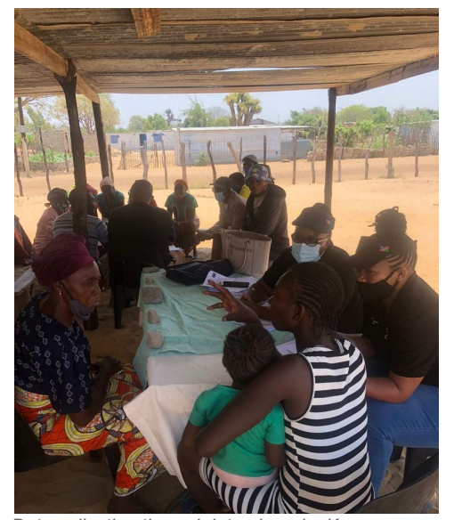
Data collection through interviews in Kavango Region of Namibia, at the border with Angola.

On 16 October, UNHCR's implementing partner in Namibia, the Legal Assistance Centre (LAC), in collaboration with the Minister of Home Affairs, Immigration, Safety and Security convened a Ministerial meeting in Windhoek on "A Study on Statelessness And Those At Risk of Being Stateless In Namibia." The meeting resulted in the commissioning of the study on statelessness to be carried out in all regions in Namibia, which builds on the pledges made by Namibia in 2019 to eradicate statelessness. The study, which is being conducted by LAC, with the support of UNHCR and the Ministry of Home Affairs, is now well underway and will be concluded in January 2021, with a final survey in the Omaheke Region, in the eastern part of Namibia. The aim of the study is to collect data on populations affected by statelessness in Namibia.