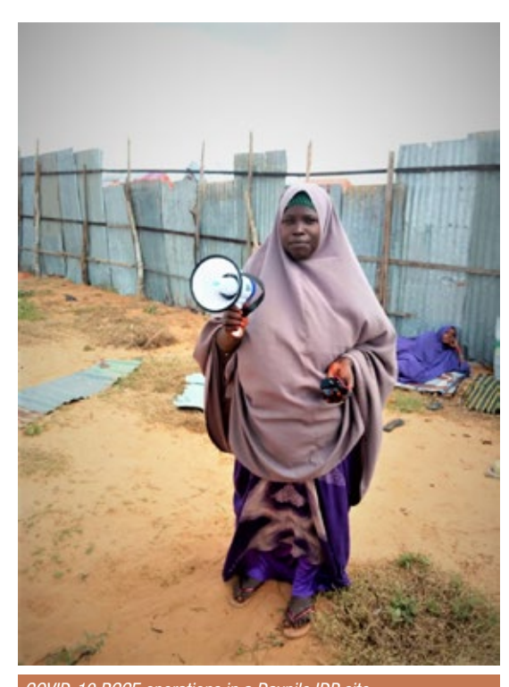
COVID-19 RCCE operations in a Daynile IDP site