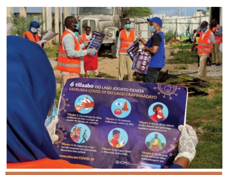
ocal hygiene promoters trained on COVID-19 in IDP sites in Banadii Photo/IOM Somalia/Hamza Osman - 2020

The year of 2020 was made noteworthy through the creation of a number of new CCCM tools. July 2020 saw the CCCM cluster establish a standardized complaints feedback mechanism (CFM) system allowing for all cluster partners to utilize the same mechanism countrywide. The standardized CFM has created evidence-based data used for inter-cluster referrals in addition to fueling the CFM monthly factsheet which showcases complaints trends and sector needs. Tools such as the site verification were greatly enhanced to obtain valuable persons with disabilities (PwDs) data, site-level risks, and settlement density.