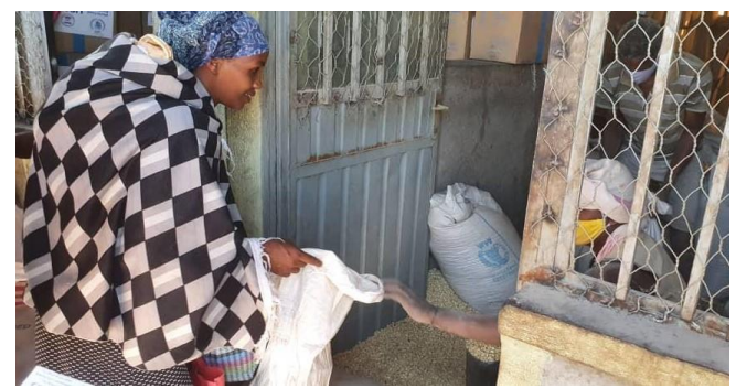
For the first time after the conflict in Tigray, UNHCR, WFP and ARRA distributed food ration to 25,000 Eritrean refugees in Adi-Harush and Maiaini camps.