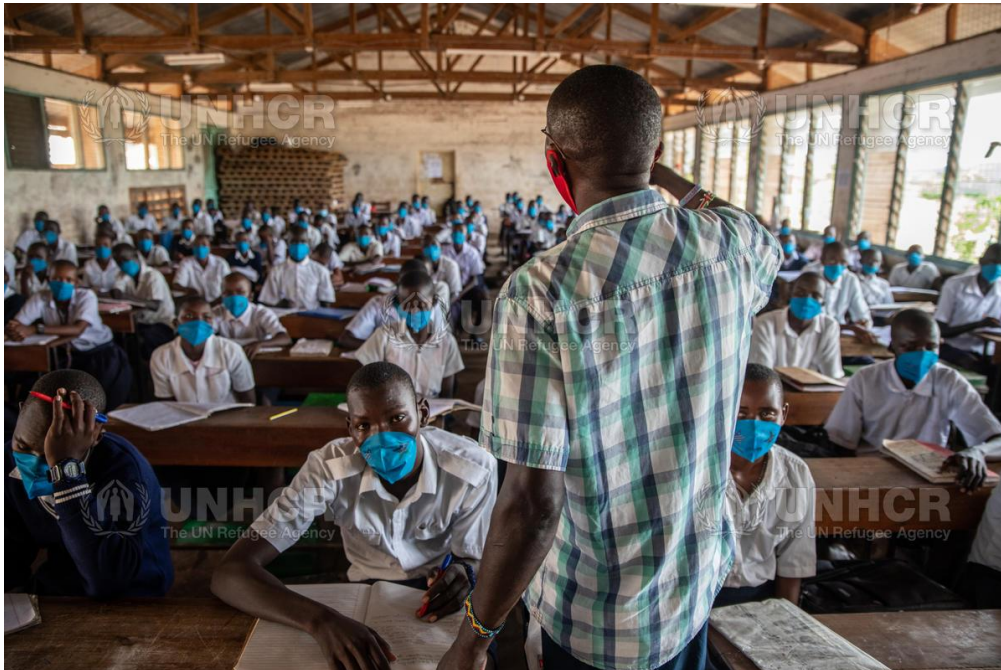
Students at Arid Zone Primary School, Kakuma attend a lesson while wearing facemasks. UNHCR and partners are implementing COVID-19 protocols to ensure a safe environment for refugee students and teachers and are supporting host-community schools.

In Somalia , to prevent the spread of COVID-19 among students and school staff, 20 schools were provided with additional hand washing facilities and soaps.