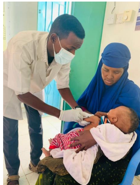
A nurse administering measles vaccine to refugee child in Bossaso.