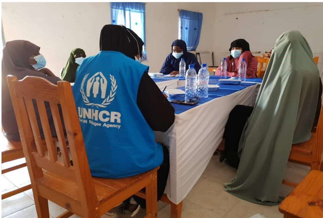
UNHCR team conducts a focus group discussion (FGD) with refugee and asylum-seeker women in north Galkayo, Puntland State.