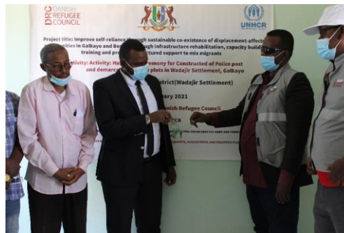
Handing over of the police post to the authorities in north Galkayo.