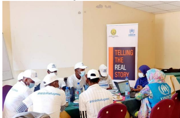
UNHCR and PoCs in a participatory assessment session in Hargeisa on 11 January 2021.