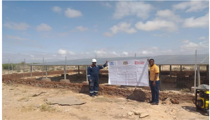
The project site of the rehabilitated borehole.