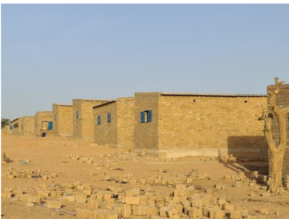
Construction of social housing for the most vulnerable refugees and host households is ongoing in the Tillabery region. UNHCR has pledged to construct 4000 social houses in Tillabery