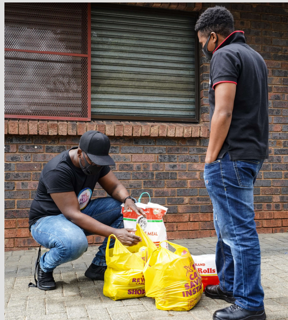
A distribution of food parcels by Fruit Basket, supported by UNHCR, in Johannesburg, South Africa.

In recognition of their innovative approaches for protection and delivery of services to refugees and asylum-seekers, Fruit Basket was recognized as a winner of UNHCR's 2020 NGO Innovation Award .