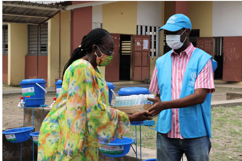
UNHCR supports a primary school hygiene campaign in Brazzaville, Republic of the Congo. The school, which is attended by refugee students, received handwashing stations and disinfectant gel.

24 isolation and 20 quarantine facilities established and supported