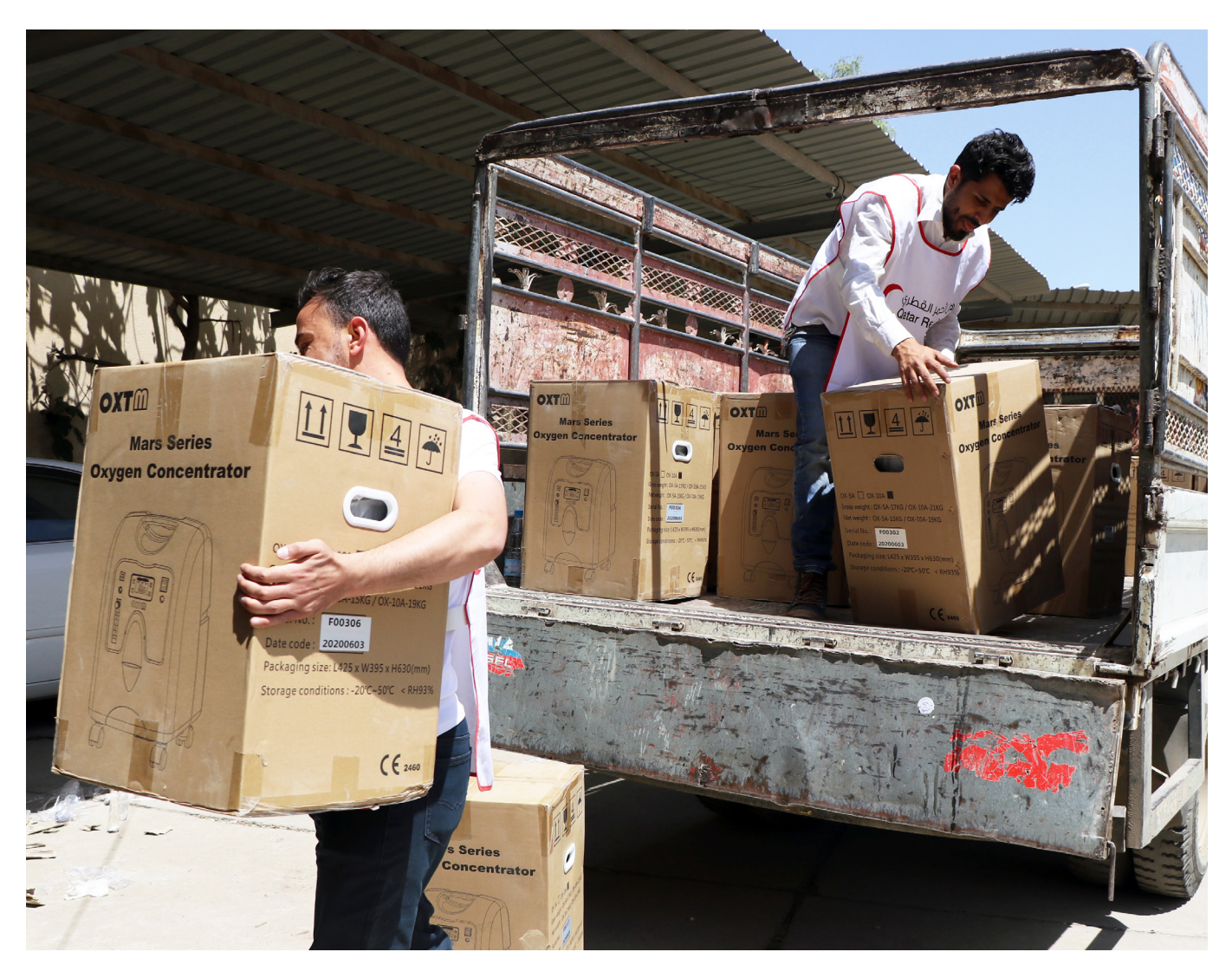
UNHCR and partner Qatari Red Crescent Society supported Al Gomhori Hospital in Sana'a, Yemen with ventilators, hospital beds and other medical equipment.

In 2021, UNHCR is seeking USD 924 million — of which over 50 per cent is mainstreamed in the annual budget and some USD 455 million is sought through the <u>COVID-19 Supplementary Appeal</u> — for activities in 2021 related to the exceptional socio-economic and protection impacts of COVID-19. As of 4 May, the Supplementary Appeal is 11 per cent funded , with USD 50.9 million received , of which USD 4.8 million is for the MENA region.