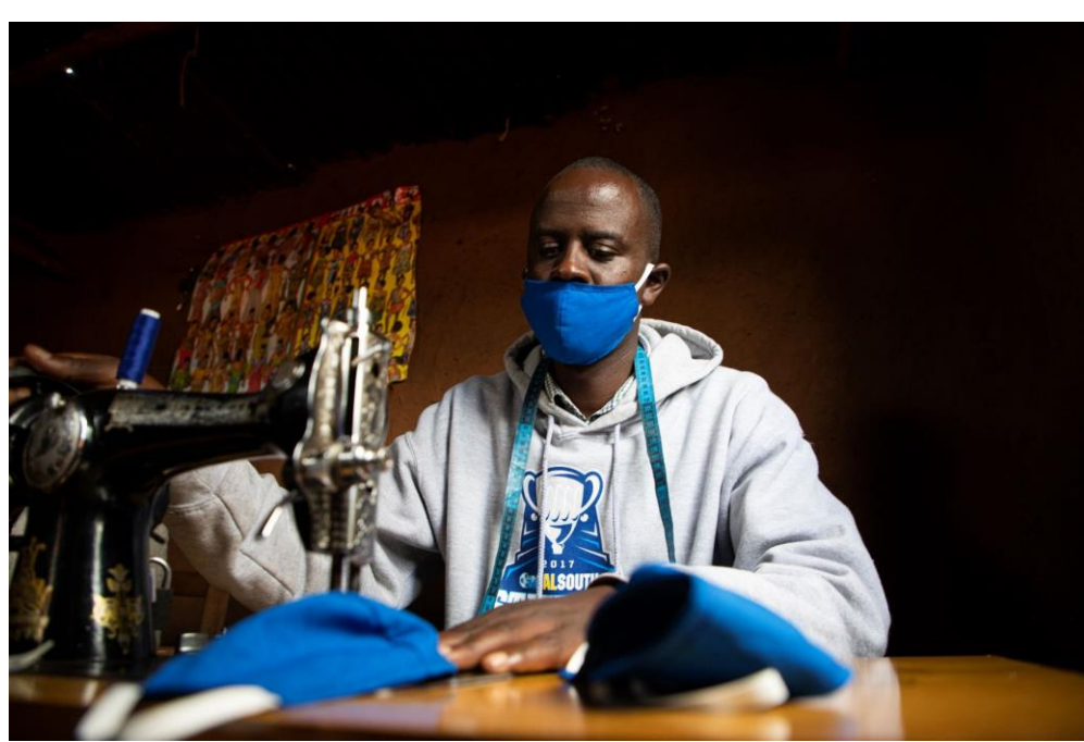
UNHCR Burundi Refugees

In Uganda , the Government, UNDP, UNHCR and partners launched the Jobs and Livelihood Integrated Response Plan for Refugees and Host Communities (JLIRP), which envisions self-reliant and resilient refugee and host community households in refugee hosting districts included in a sustainable manner in local development by 2025.