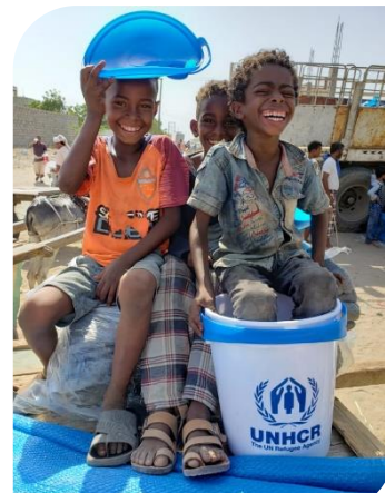
Displaced Yemeni children play together during a UNHCR distribution of core relief items in Al-Manswriah district in Hudaydah governorate

Lack of funding has forced UNHCR to temporarily halt its rental subsidy programme, affecting thousands of vulnerable families. UNHCR is extremely grateful to donors who contributed to the Yemen operation to date, allowing UNHCR to continue critical lifesaving interventions. Nevertheless, as of June this year, two-third of the Operation's programmatic interventions remain critically underfunded. UNHCR's rental subsidy programme and refugee interventions in particular — a lifeline for some 140,000 refugees, mainly from Somalia and Ethiopia — currently have insufficient funding to continue benefitting those most in need. As a result, many IDPs and refugees are resorting to harmful coping mechanisms such as reducing food intake or health expenditures, child labour, and survival sex. More than 11,500 families (69,000 individuals) in Sana'a alone have been affected by the halt of rental subsidies this year, leaving many at heightened risk of eviction. UNHCR hopes that projected unearmarked funding will allow for a resumption of the subsidy programme during the second half of 2021.